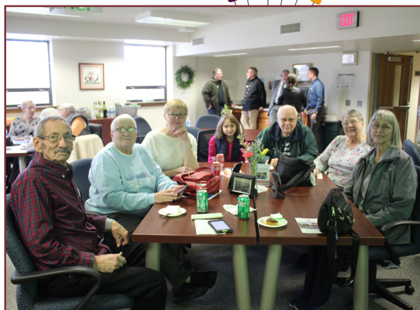
Alumni joined us to celebrate 160 years of Bethany!