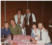
Circa 1984 Alumni Event

Keep an eye on your mail, social media, and emails, for your personal invitation to the event of the year here on the Bethany Campus! We are looking forward to your visit!