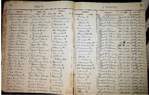
Bausman Memorial Church Records of Marriage Pg. 68 & 69

I can recall "a sea of little colored dots" as a youngster until we ended up in the middle trying to collect into our basket all the eggs we could find. Easter egg hunts were a joy – even for some a bit older – especially when a special coding meant a prize of couple of dollars.